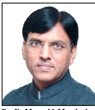
By: Dr. Mansukh Mandaviya

The complex and evolving nature of today's healthcare challenges mean that in many cases a united response mounted by the world as a whole will be way more effective than reaction of sum of its parts—that is individual countries.