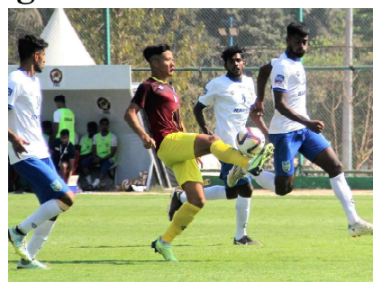
Karnataka scored the only goal of the match in the 20th minute as it beat defending champion Kerala.

Ravi Babu Raju's wards were immediately dominant, pressing high without the ball and shifting flanks with ease when on it. Kerala, whose squad boasts of a mere three players from their title winning run looked a bit lost, missing simple passes and making un-